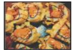
Rockin' Shrimp Tempura 🍌 10.95 Deep-fried shrimp tempura, imitation crab, & avocado roll topped w/ chipotle mayo & eel sauce