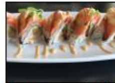
Sunset 11.95 Shrimp tempura, imitation crab, & cucumber roll topped w/ salmon, avocado, sliced lemons, eel sauce, & spicy mayo