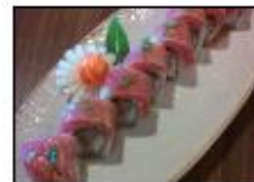
GoGo 10.95 Shrimp tempura, imitation crab, avocado, & cucumber roll topped w/ seared tuna & sweet soy glaze