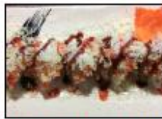
Red Dragon 11.95 Eel, avocado, & cucumber roll topped w/ spicy tuna, tempura crunch, & eel sauce