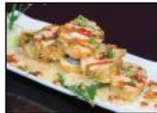
Ex-Boyfriend 🍌 10.95 Spicy tuna, imitation crab, cream cheese, jalapeño, & avocado roll, then deep-fried & topped w/ wasabi mayo & eel sauce