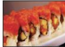
Double Double 🌶️ 9.95 Spicy tuna, avocado, & cucumber roll topped w/ more spicy tuna & sprinkled w/ chili powder