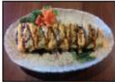
Chuck Norris 🍌 9.95 Shrimp tempura, eel, spicy tuna, & avocado roll, then deep-fried & topped w/ spicy mayo & eel sauce