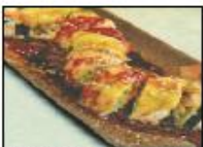
Mira Mesa 🍌 11.95 Shrimp tempura, imitation crab, & cucumber roll topped w/ eel, ebi shrimp, avocado, & eel sauce