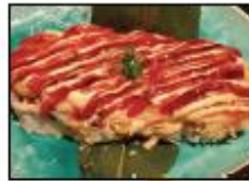
Badda Bing 🍌 11.95 Imitation crab & avocado roll topped w/ spicy dynamite-sauced shrimp & langostino, then baked & topped w/ masago & eel sauce