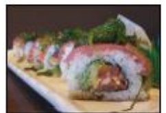
Poki 9.95 Spicy imitation crab, cucumber, & avocado roll topped w/ tuna & seaweed salad