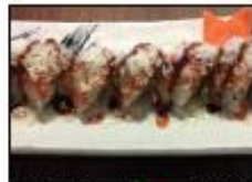
Killer Bee 🌶️ 10.95 Shrimp tempura, imitation crab, avocado, & cucumber roll topped w/ spicy tuna, panko crumbs, sweet red sauce, & eel sauce