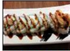
Soft Shell Crab 🍌 9.95 Tempura-battered soft shell crab, imitation crab, avocado, & cucumber roll topped w/ eel sauce