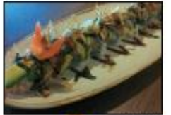
Dragon 🍌 11.95 Shrimp tempura, imitation crab, avocado, & cucumber roll topped w/ eel, avocado, bonito flakes, & eel sauce