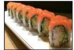
Sunshine 11.95 Imitation crab, avocado, & cucumber roll topped w/ salmon & house dressing