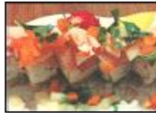
Sancho 11.95 Spicy tuna, imitation crab, avocado, & cucumber roll topped w/ yellowtail & lime shrimp ceviche