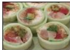
Fantastic 4 11.95 4 different kinds of fish, spicy tuna, & imitation crab wrapped w/ cucumber & topped w/ garlic ponzu