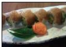
Mr. Potato Head 🌱 8.95 Veggie roll topped w/ Inari tofu