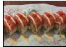
Sensual Pleasure 🌶️ 11.95 Spicy scallops, avocado, & cucumber roll topped w/ spicy tuna, spicy mayo, & sriracha sauce