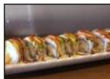
Tiger 🍌 11.95 Shrimp tempura, imitation crab, & cucumber roll topped w/ ebi shrimp, avocado, eel sauce, spicy mayo, & Sriracha