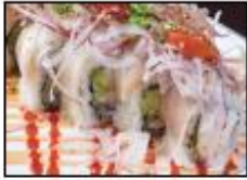
Albacore Special 10.95 Spicy tuna, imitation crab, avocado, & cucumber roll topped w/ albacore, onions, & ponzu sauce