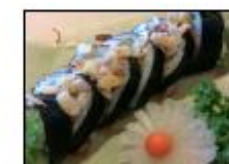
Veggie Tales 🌱 8.95 Lettuce, veggie tempura (carrot, squash, kabocha, & asparagus) roll topped w/ sliced almonds & sesame dressing