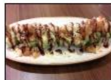
Marco Rolo 11.95 Spicy tuna & cucumber roll topped w/ avocado, chopped panko-battered soft shell crab, tempura crunch, & eel sauce