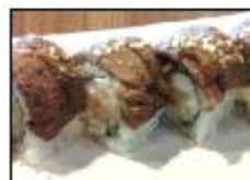
Surf & Turf 🍌 11.95 Shrimp tempura, avocado, imitation crab, & cucumber roll topped w/ seared ribeye beef, minced garlic, & sesame dressing