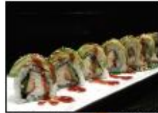
Caterpillar 🍌 10.95 Eel & cucumber roll topped w/ avocado & eel sauce