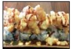
Lobster Volcano 🍌 10.95 Imitation crab, avocado, & cucumber roll topped w/ popcorn langostino & eel sauce