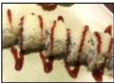
Shrimp Crunch 🍌 8.95 Shrimp tempura, imitation crab, avocado, & cucumber roll topped w/ tempura crunch & eel sauce