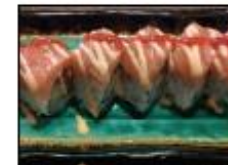
Pink 🌶️ 10.95 Spicy tuna, avocado, & cucumber roll topped w/ salmon, spicy mayo, & sriracha sauce