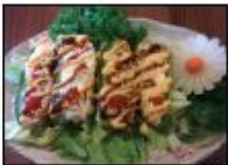
Kaboom 🌶️ 8.95 Jalapenos topped w/ cream cheese, imitation crab, & spicy tuna, then deep-fried & topped w/ spicy mayo & eel sauce