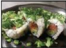
Diego 🌶️ 9.95 Spicy tuna, avocado, & cucumber roll topped w/ cilantro & jalapeño