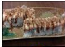
Awesome 🍌 10.95 Shrimp tempura, imitation crab, avocado, & cucumber roll topped w/ salmon, eel sauce, & dynamite sauce, then baked