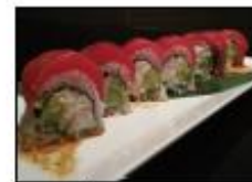
Hawaiian 10.95 Imitation crab, avocado, & cucumber roll topped w/ tuna & house dressing