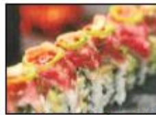
Red Hot Chili Pepper 9.95 Spicy salmon, jalapeño, & cucumber roll topped w/ spicy tuna