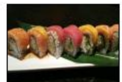
Wango Mango 10.95 Imitation crab, avocado, & cucumber roll topped w/ tuna, salmon, mango, & sweet soy glaze