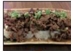
Bulgogi 🍌 10.95 Imitation crab, cucumber, & avocado roll topped w/ Korean BBQ bulgogi, sesame seeds, & eel sauce