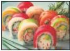
Rainbow 10.95 Imitation crab, avocado, & cucumber roll topped w/ avocado, tuna, salmon, ebi shrimp, & albacore