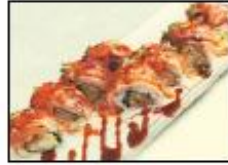
Samurai 11.95 Spicy tuna, shrimp tempura, avocado, & cucumber roll topped w/ salmon, eel sauce, & spicy mayo