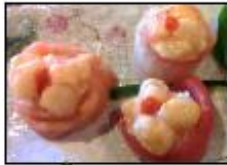
Rose 🌶️ 11.95 Spicy scallops wrapped w/ tuna, salmon, & red snapper