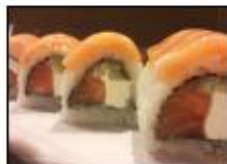
Super Philly 11.95 Salmon, cream cheese, & cucumber roll topped w/ salmon & house dressing