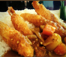
EBI KATSU CURRY

6 pcs of toasted eel over a bed of sushi rice & topped w/ eel sauce