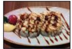
CA Beach 🍌 10.95 Imitation crab, cucumber, & avocado roll topped w/ scallops, dynamite sauce, & eel sauce, then baked