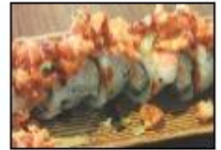
Shrimp Bizkit 🌶️ 11.95 Spicy imitation crab, avocado, & cucumber roll topped w/ ebi shrimp, chopped panko-battered shrimp, jalapeño, & spicy mayo