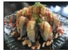
Renaissance 🍌 11.95 Shrimp tempura, imitation crab, & avocado roll topped w/ deep-fried scallops, tempura crunch, & special sauce