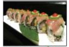
Hamachi Lover 🌶️ 10.95 Yellowtail, avocado, & cucumber roll topped w/ more yellowtail, jalapeno, ponzu sauce, & Sriracha