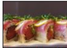
Sisters' Choice 11.95 Spicy tuna & cucumber roll topped w/ tuna, sliced lemons, cilantro, & jalapeños