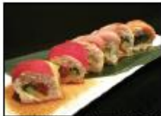
Ex-Girlfriend 11.95 Imitation crab, avocado, & spic tuna roll topped w/ salmon, tuna, yellowtail, & soy mustard sauce (NO RICE)