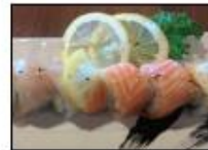
Lemon 10.95 Imitation crab, avocado, & cucumber roll topped w/ salmon, yellowtail, & slices of lemon